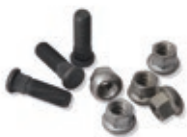
Steel Lug Nut Fits All Steel Wheels 1950-1976 N-020-112-1 37mm Wheel Stud As Original NLA-34-132

Highland Heights, Ohio 44143 USA 800 342 1414 | Reno, Nevada 89431 USA 800 438 8119