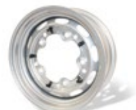
Drum Brake Wheel New USA Production High Quality, DOT-Tested Complete with Clips NLA-361-012-10 15x5.5 Painted Shown