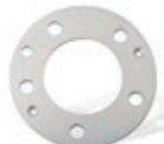
7mm Wheel Spacer 1965-1969 911/912 Factory Aluminum Spacer As Original 901-352-413-00